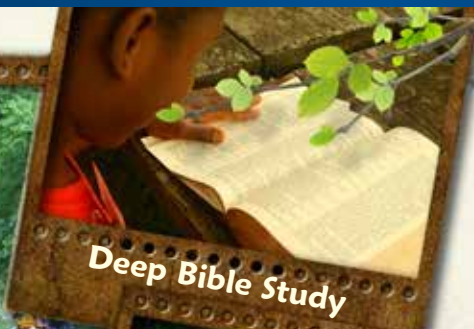
Deep Bible Study

"Deep Bible Study gave me a broader view of the Bible."