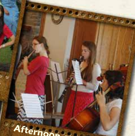
Afternoon outreach at a nursing home

See you next year at PVYBC 2014! June 22-29 "Transformed"