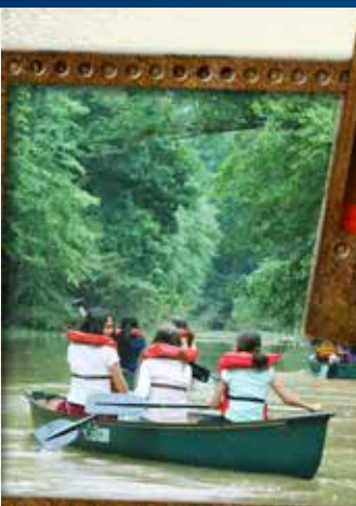
Canoeing down the Robinson River