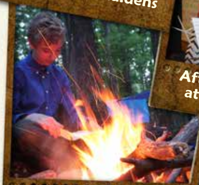
Wilderness survival class spends a night outdoors

See you next year at PVYBC 2014! June 22-29 "Transformed"